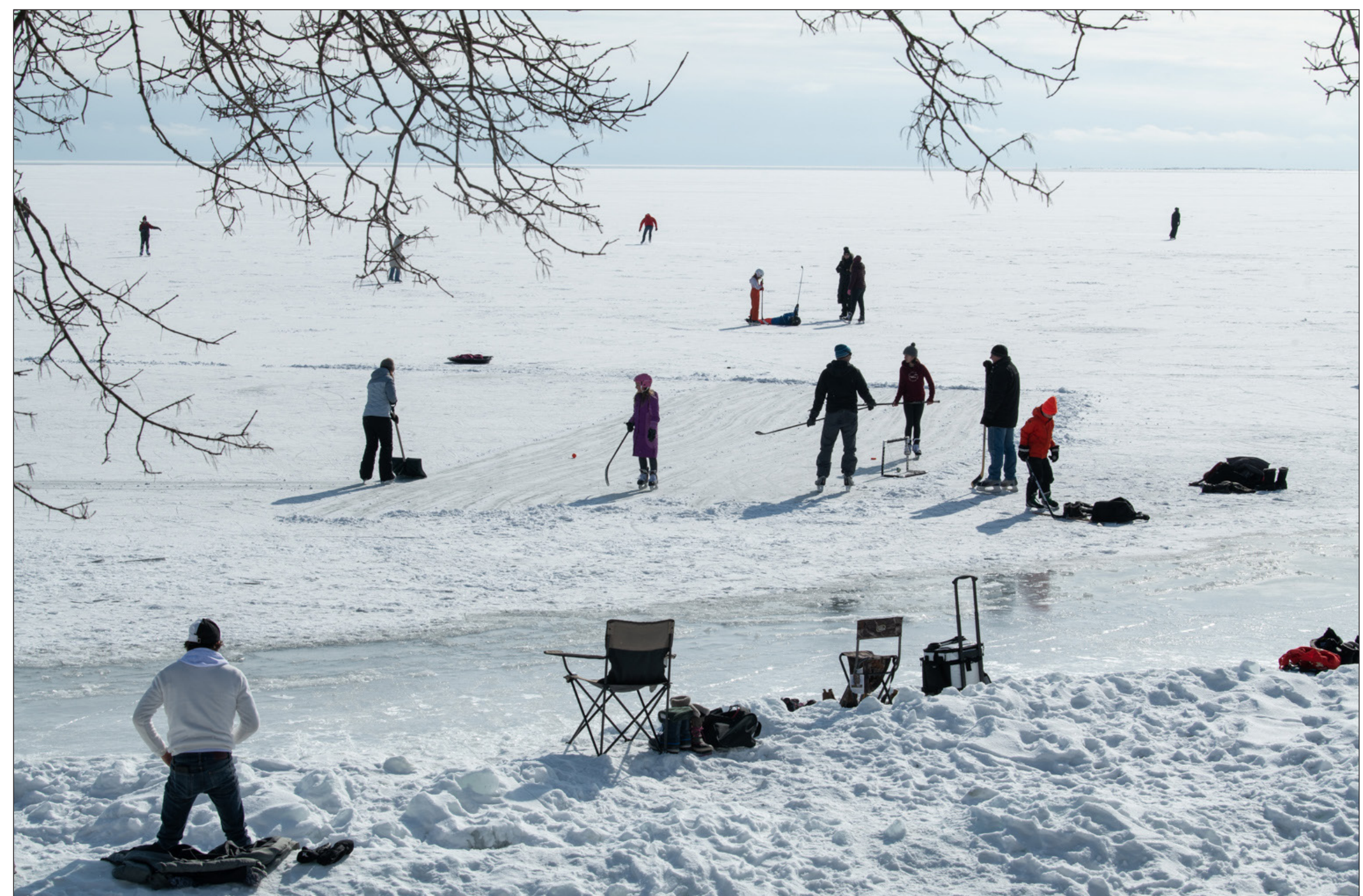
Despite the warnings from the city to avoid the ice on Lake Ontario in Kingston, there were many families enjoying activities on the lake during Family Day. The cold weather of the last few days and the warmer temperature of family day encouraged many families to spend time outdoors.