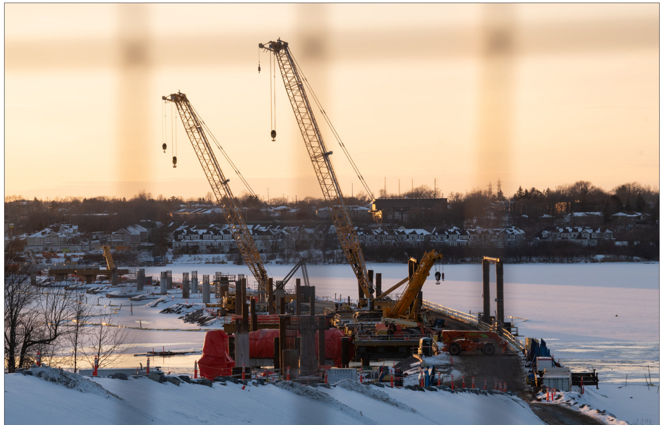
The third crossing bridge in Kingston viewed from the east side of the Cataraqui River.